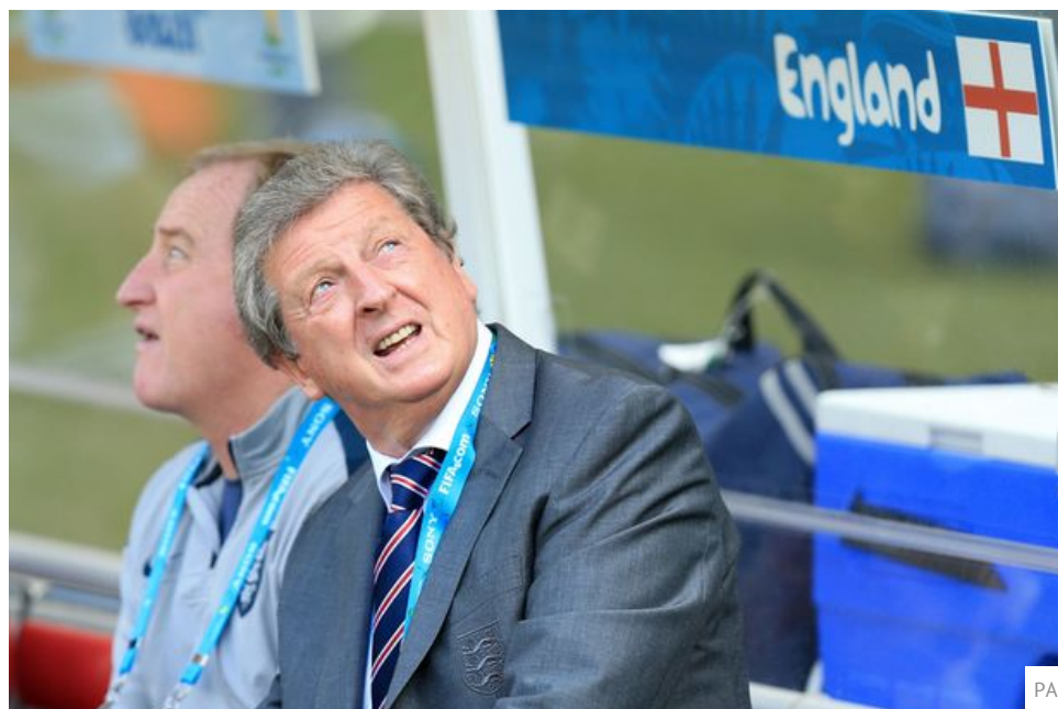
Now what? Hodgson will now prepare for Euro 2016

But the positives were too few. There were too many mistakes, critical errors. Too little of the cutting edge needed.